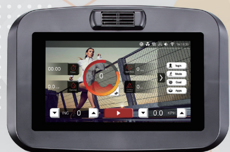
ADTech T2 18.5" Touch Screen